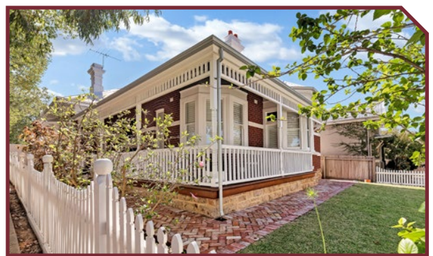
22 Heytesbury Road, Subiaco