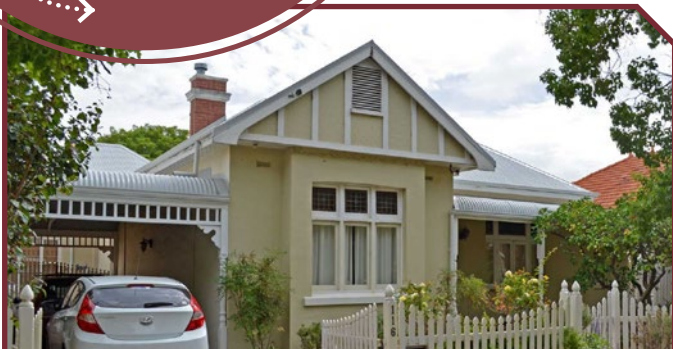
> Austin Bastow