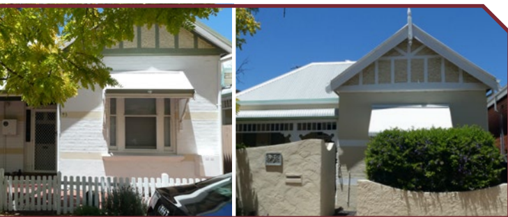
93 Park Street, Subiaco