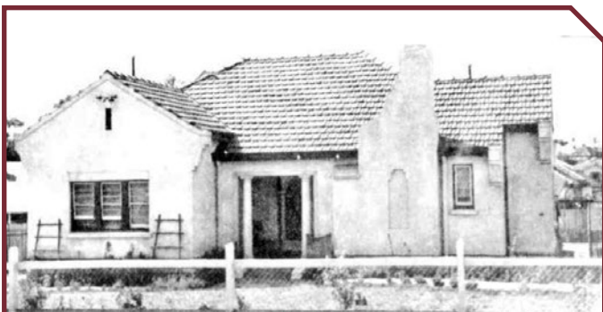
> Daglish Workers Homes Board Subdivision