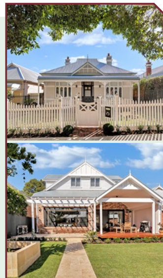
12 Rawson Street, Subiaco

This Federation era cottage in the Redfern and Union Street Heritage Area has been lovingly restored and extended. It demonstrates how heritage places can be adapted for modern living while retaining their heritage and streetscape values.