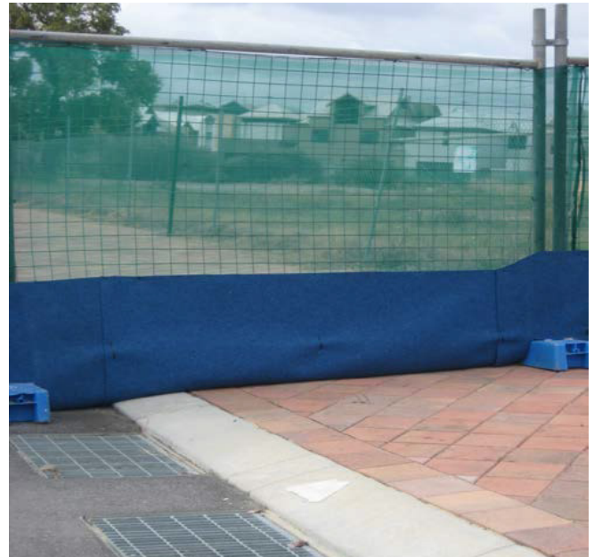
Figure 2: Front view showing sediment control fence protecting stormwater drains.

Sediment control fences, when used correctly, are an effective way to retain sand and other building material on site.