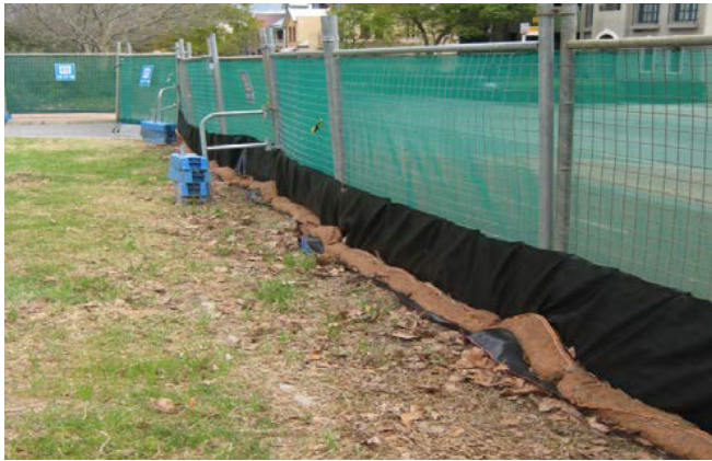
Figure 3: Side view showing fence with geotextile fabric secured to the ground.