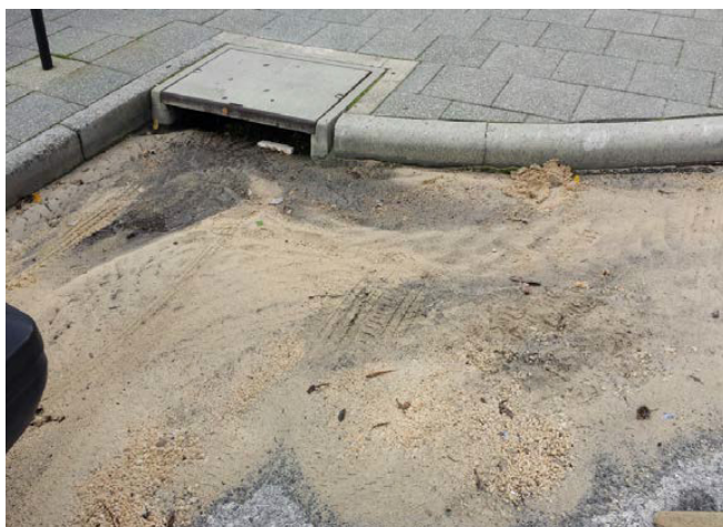
Figure 1: Build up of sand washing into side-entry drain