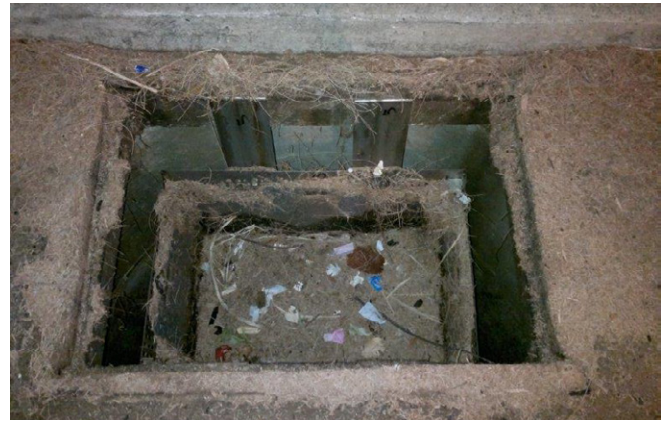
Figure 5: Stormwater drain insert to collect sediment.

The height of the geotextile material, after the lower edge is properly sealed and secured, should be a minimum of 600 mm for residential blocks. For large construction sites or if dust is also likely to be a problem, then the sediment control fence may need to be higher.