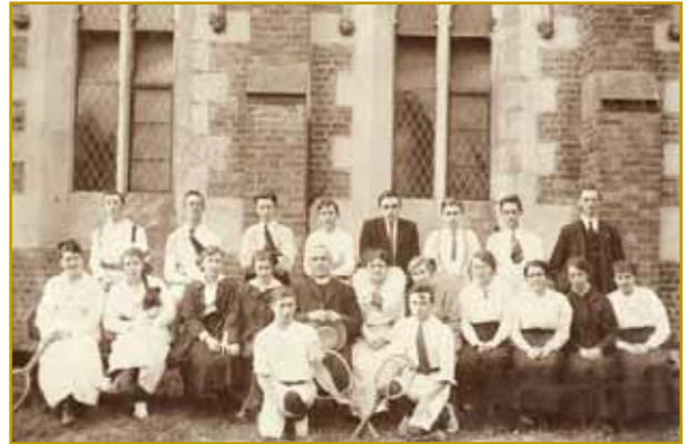
St. Andrews Church Tennis Club, 1917

Retrace your steps, making a detour to your right along Barker Road to see St. Andrews Church, due to celebrate its Centenary in 2006.