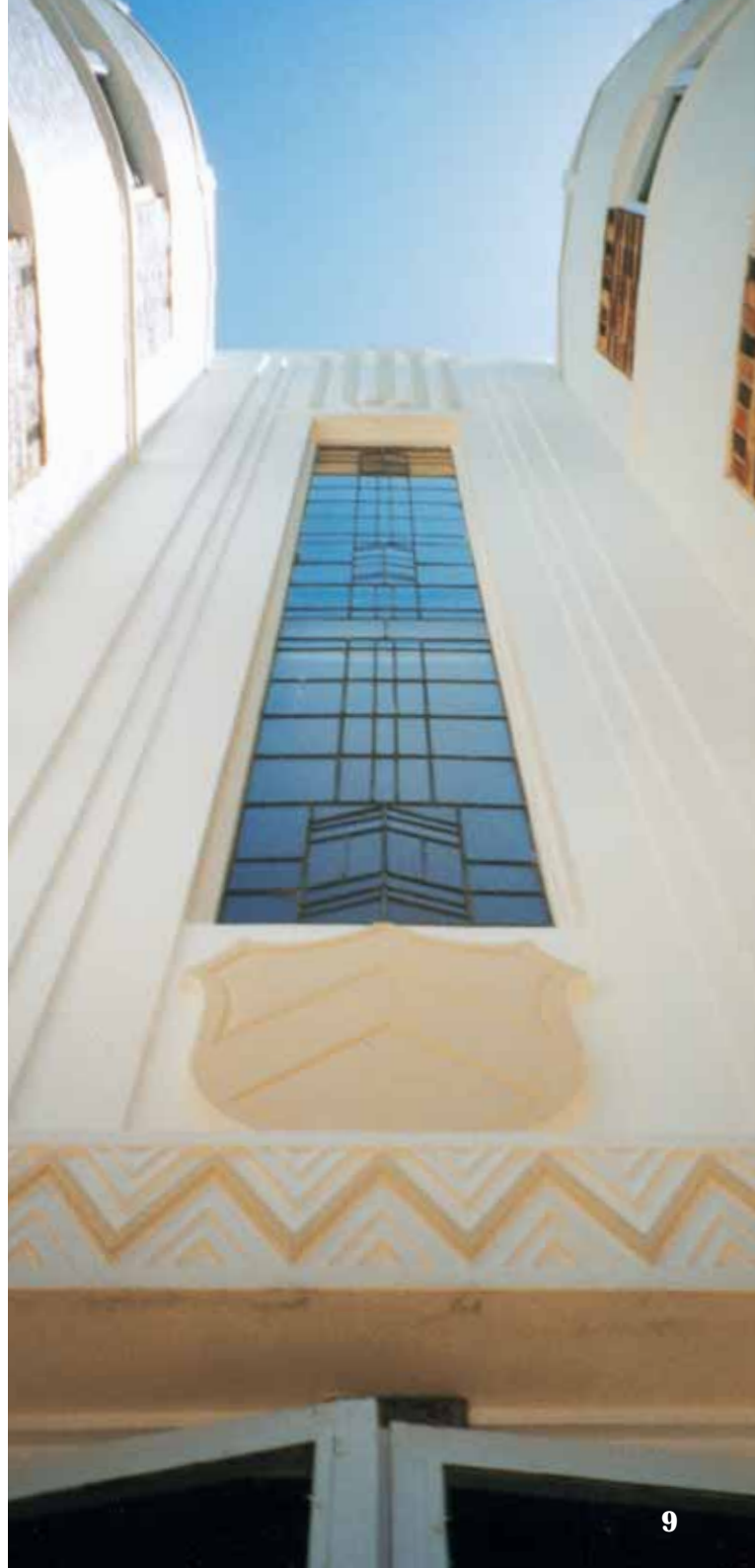
Opposite: Attunga Flats, Thomas Street, 2004

Across the road, several multi-storey red brick buildings comprise the Wandana Apartments. This extensive complex is a notable part of the wide range of housing options available to the residents of Subiaco.