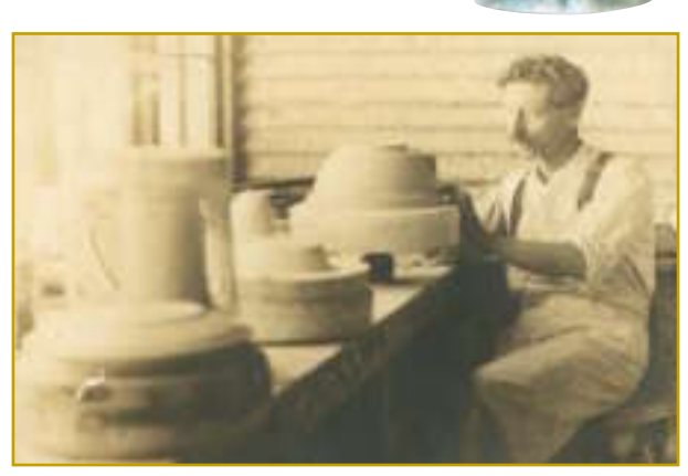
A modeller and mould maker at Australian Fine China

Australian Fine China began as Calyx Pottery in 1921. The factory was staffed by experienced potters from England. In 1941 it was leased by Brisbane and Wunderlich who later owned the business and traded as Bristile. The production of industrial porcelain goods and the supply of