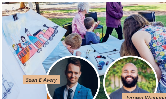
Sean E Avery