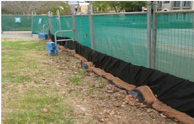
Figure 3: Side view showing fence with geotextile fabric secured to the ground

The height of the geotextile material, after the lower edge is properly sealed and secured, should be a minimum of 600 mm for residential blocks. For large construction sites or if dust is also likely to be a problem, then the sediment control fence may need to be higher.