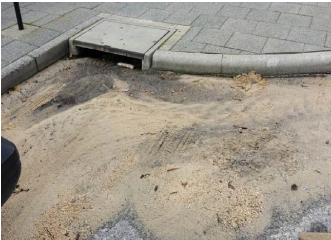
Figure 1: Build up of sand washing into side-entry drain

Sediment is fragmented material such as silt, sand and gravel that is transported from a site by wind or stormwater, and eventually deposited downstream in the environment (Figure 1). This is usually in a body of water such as a lake or river, where it settles and forms a layer on the bottom.