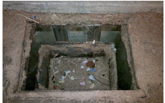
Figure 5: Stormwater drain insert to collect sediment

In some instances, a sediment control fence may be difficult to install due to the location of stormwater drains requiring protection. In such cases, a stormwater drain insert can be installed in a gully entry drain to perform a similar function to a sediment control fence (Figure 5).