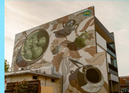
3. Still-life with Pears, Danby | Xanthis Lane