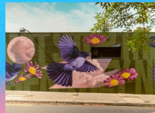
11. Tender Time, Miser | 30 Townsend Rd