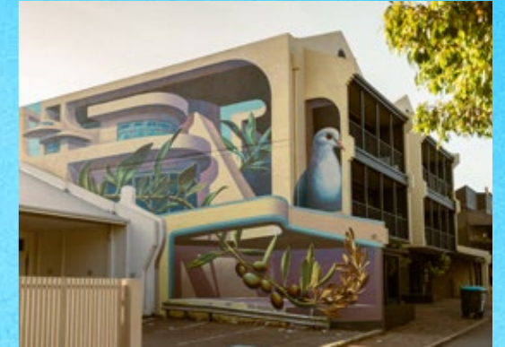
4. Space of Peace, Wild Drawing | 36 Rowland Road