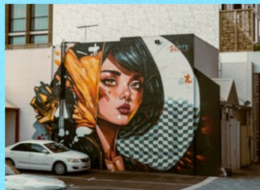
9. Checkers, Sofles | Sagar Lane