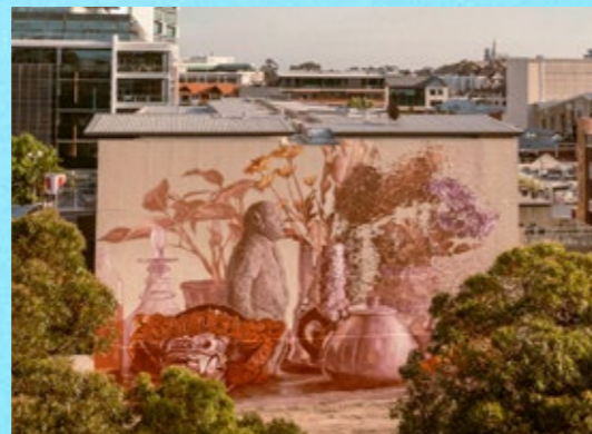
5. Studio Window 3, Fintan Magee | 20 Rowland Street