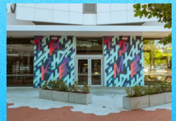
8. Take Time, HWJ | Vibe Hotel