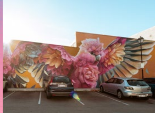
1. Flaming Galahs, Curtis Hylton | Barker Road Car Park

Discover the legacy of No More Blank Walls Subi. Embark on a self-guided walking tour to see the murals created during the festival.