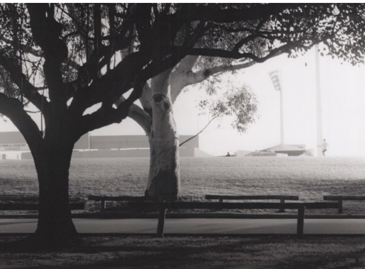
Mueller Park towards Subiaco Oval, 1997

Community members with past and present connections to the areas visited are invited to provide personal anecdotes that enhance the appreciation of the location explored during each walk.