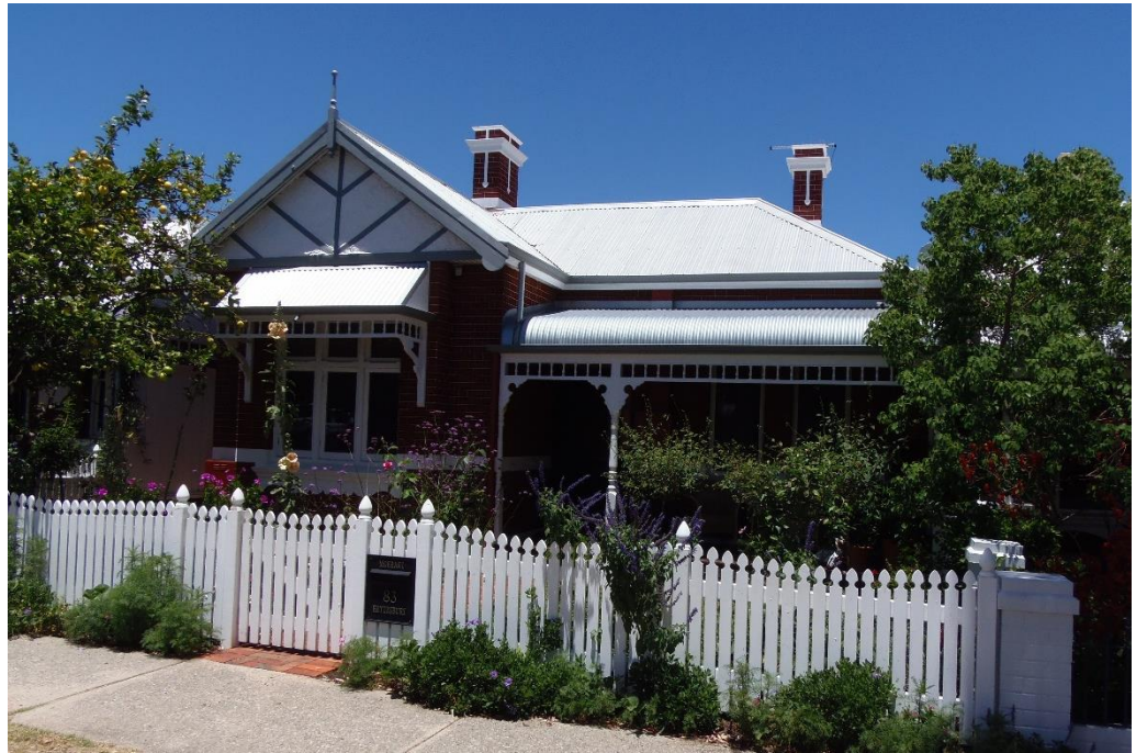
Additional Photograph (85 Heytesbury Road, December 2021)