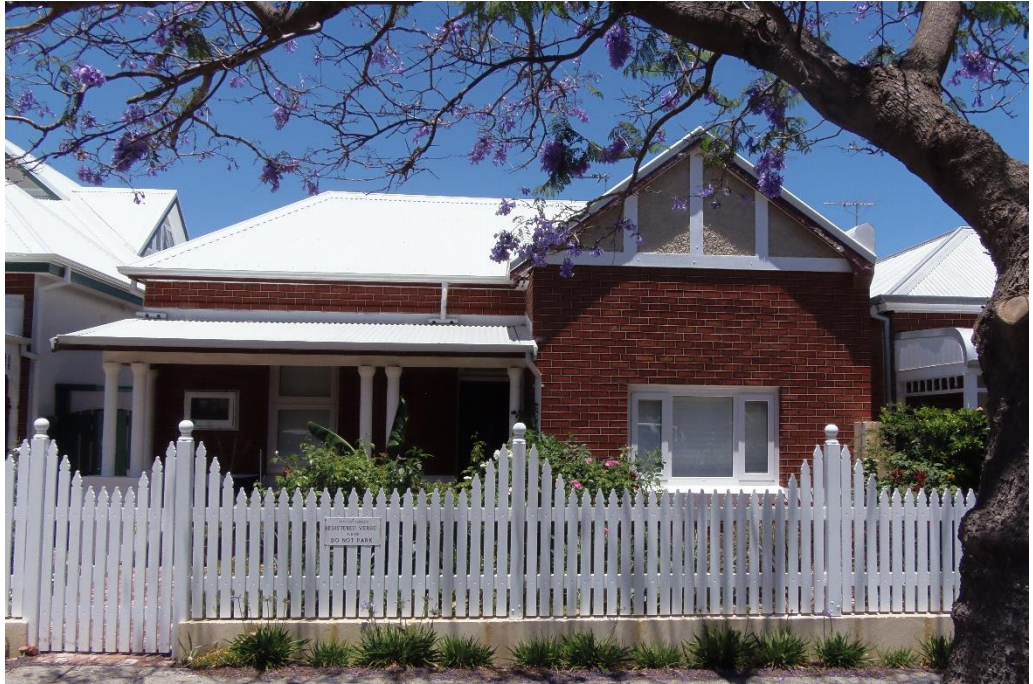
Additional Photograph (81 Heytesbury Road, December 2021)