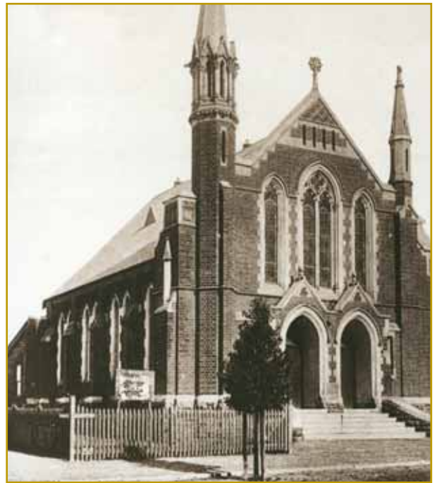
Congregational Church, Bagot Road, c.1906