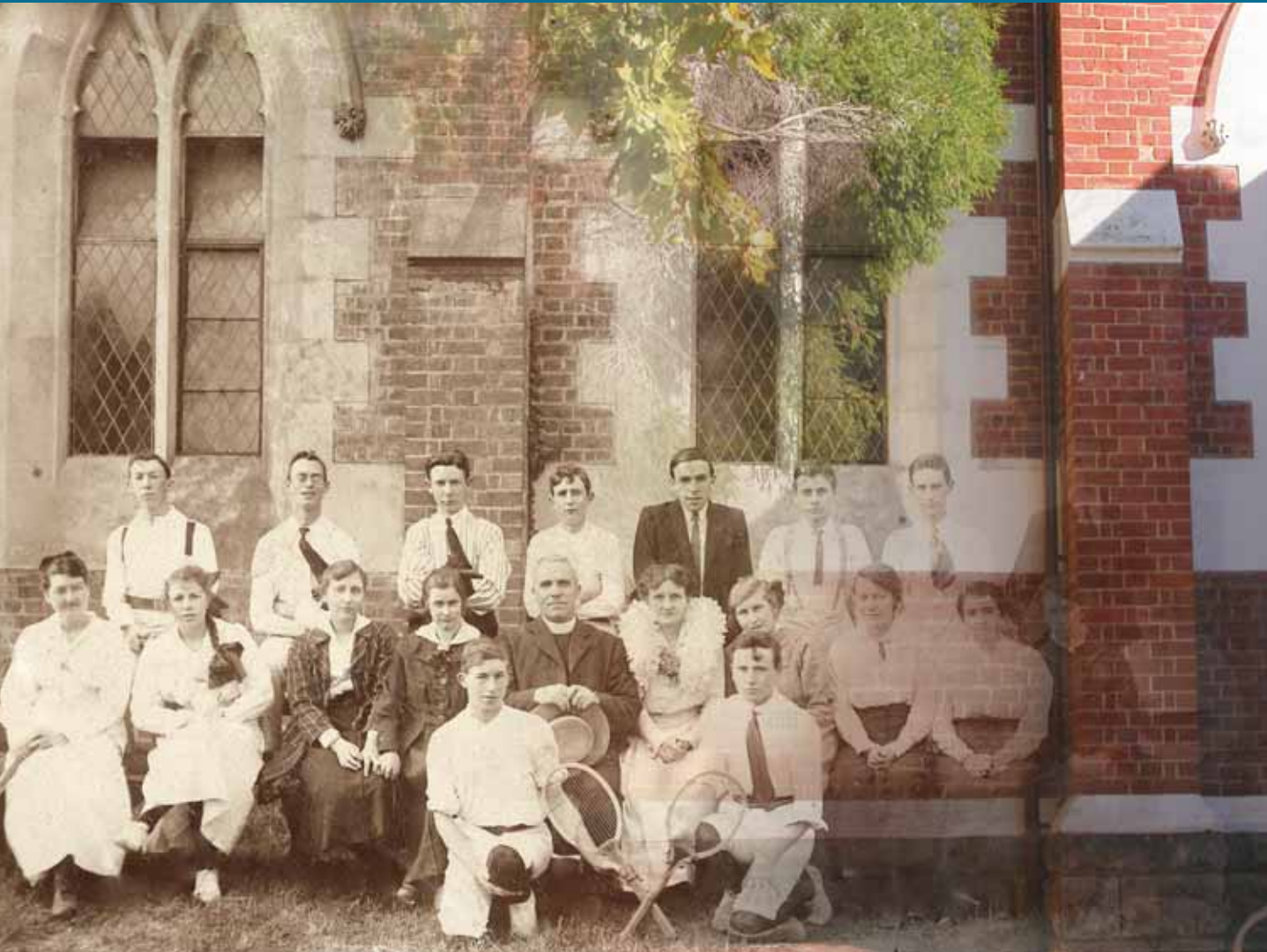
St. Andrews Church Tennis Club, 1917