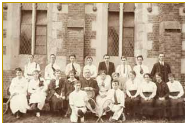
St. Andrews Church Tennis Club, 1917

Retrace your steps, making a detour to your right along Barker Road to see St. Andrews Church, due to celebrate its Centenary in 2006.