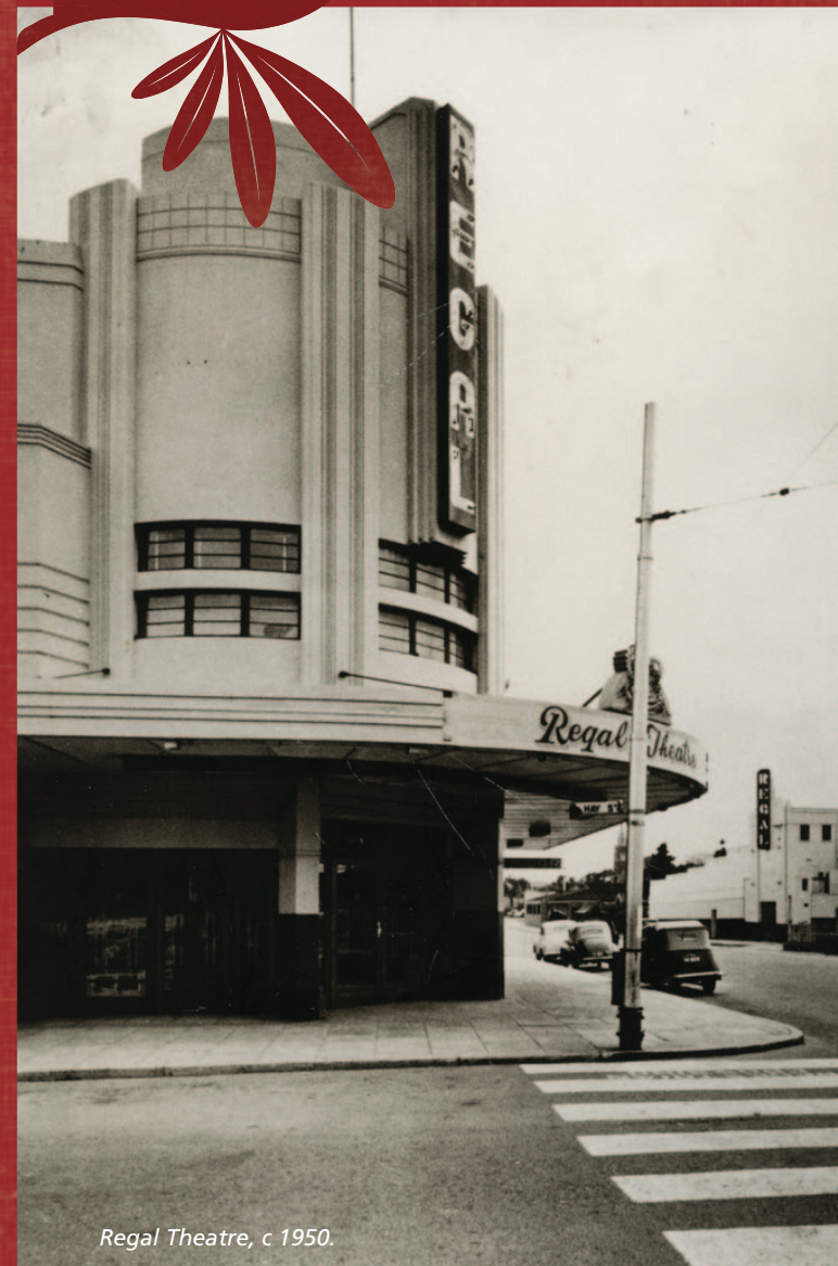
Regal Theatre, c 1950.

2016–2017 free guided walks exploring the history and environment of Subiaco