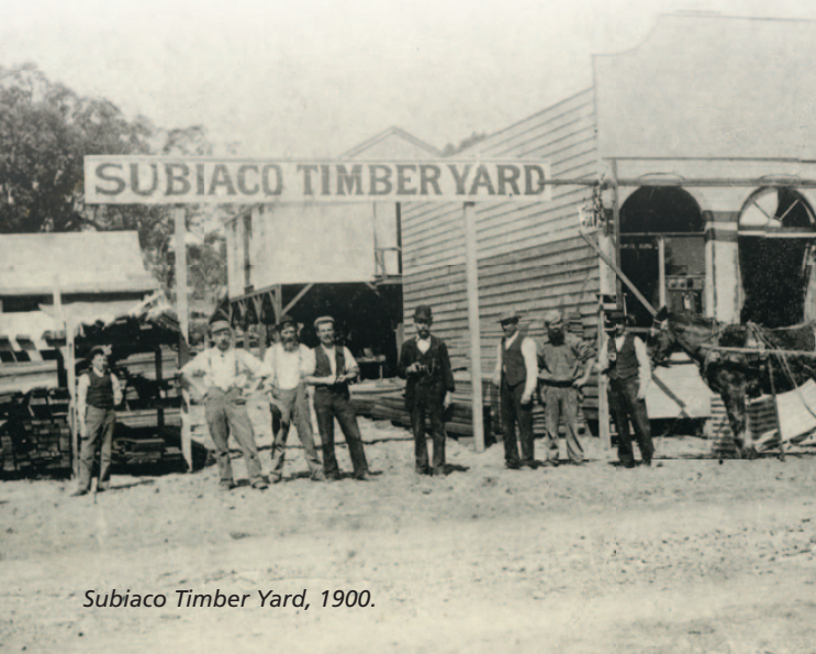
Subiaco Timber Yard, 1900.

Community members with past and present connections to the areas visited are invited to provide personal anecdotes that enhance the appreciation of the location explored during each walk.