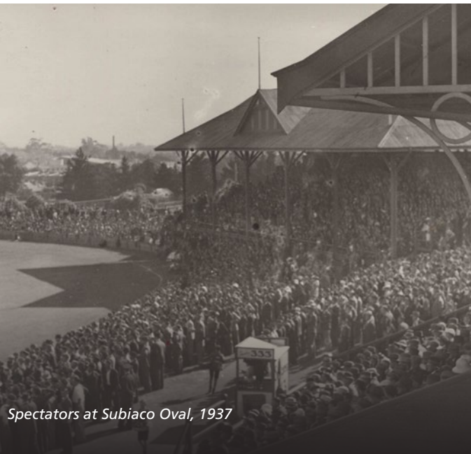
Spectators at Subiaco Oval, 1937

Community members with past and present connections to the areas visited are invited to provide personal anecdotes that enhance the appreciation of the location explored during each walk.