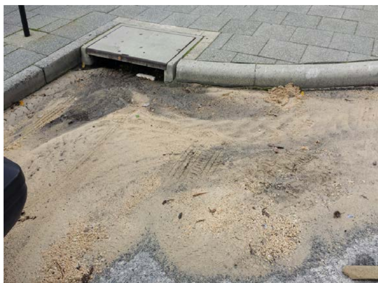
Figure 1: Build up of sand washing into side-entry drain

Aside from environmental factors, sand drift from development sites can also result in dust, causing a nuisance to neighbouring properties. The costs associated with remediation of the impacts of sediment drift can be considerable.