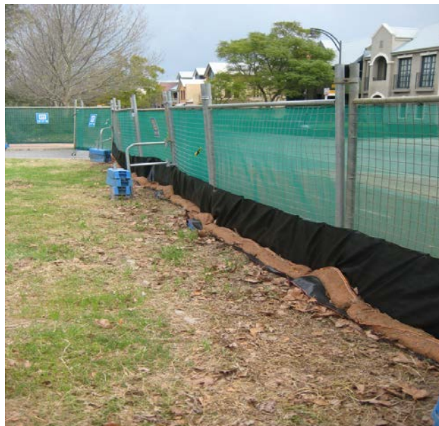
Figure 3: Side view showing fence with geotextile fabric secured to the ground.

It is necessary to secure the geotextile material at the base of the wire mesh fence to prevent sediment passing underneath the fence. The preferred method for doing this is to place the lower 200 mm (minimum) part of the fabric on the ground facing into the construction site, and buried under a 100 mm layer of coarse aggregate in a filter roll or silt sock (Figure 3). If permitted, another option is to bury the geotextile material in a trench to a minimum depth of 200 mm.