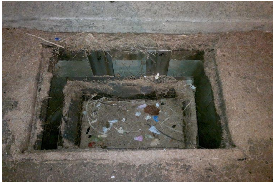
Figure 5: Stormwater drain insert to collect sediment

In some instances, a sediment control fence may be difficult to install due to the location of stormwater drains requiring protection. In such cases, a stormwater drain insert can be installed in a gully entry drain to perform a similar function to a sediment control fence (Figure 5).