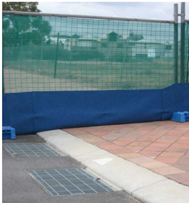
Figure 2: Front view showing sediment control fence protecting stormwater drains.

The sediment control fence enables water to pass through, but traps sand and other coarse material before it washes into the stormwater drainage system (Figure 2).